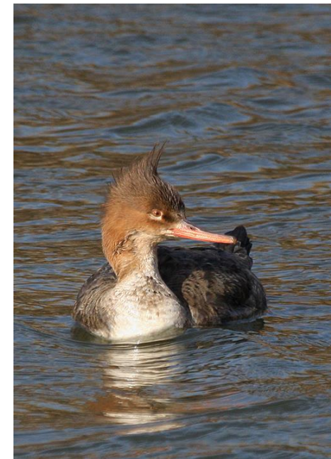
Red-breasted Merganser